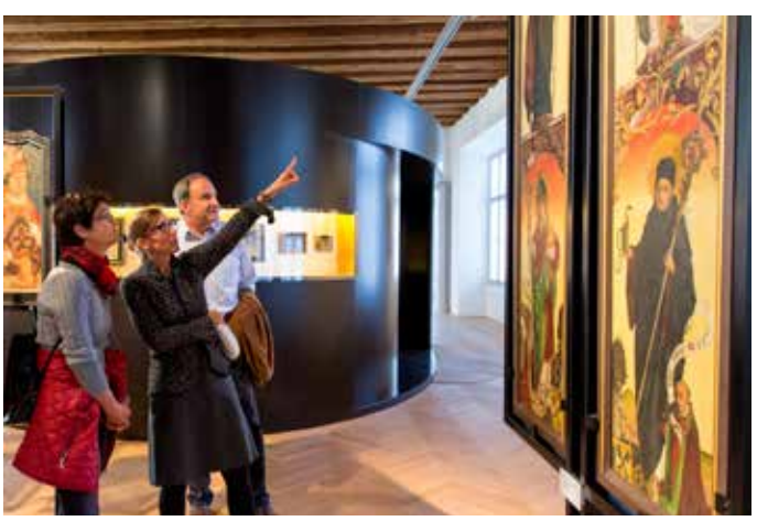
In-depth views More time for fascinating background information

Duration: 1<sup>1</sup>/<sub>2</sub> hours Group price: € 10.- / € 8.- (if access is limited) Guide fee: € 80.- (maximum number: 20, personal guide)